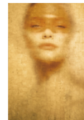
正義 七美德第一部分 JUSTITIA Seven Virtues Part I 24K金箔 50 x 75 cm 2019