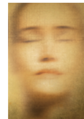
無限 Infinity 24K金箔 黑色鏡框帶陰影間隙 100 x 150 cm 2020