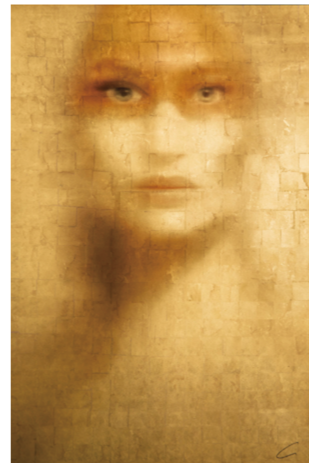
特殊電子能譜 七美德第六部分 SPES Seven Virtues Part VI 24K金箔 50 x 75 cm 2019

在與 Pashmin Art 的合作下，該藝術家部分作品於6月至7月在北京檔案館【Partnerships: A Global Dialogue through Art】展出，另外於巴特爾茨的 Pashmin Art Gallery 推出的【A Kaleidoscope of Art】展覽持續至8月26日。